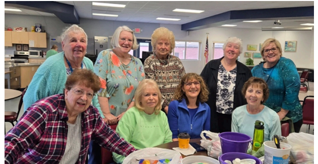
Photo: The volunteer group on the last day of sorting at the New London Senior Center.

Legion Clubhouse - 6 foot blue (to go to Rosholt Camp)