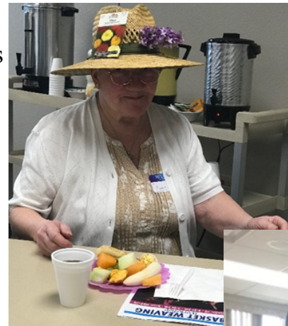
Photos: Waupaca County members wore spring hats to designate the hosts

“Let Yourself Bloom” was the message of the afternoon program. This lighthearted program helped us all appreciate the unique differences we, like flowers, bring to our home, family and community.