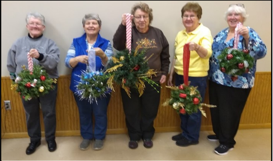
A great start to the day was decorating and lighting our holiday greenery globes traditionally called Kissing Balls.