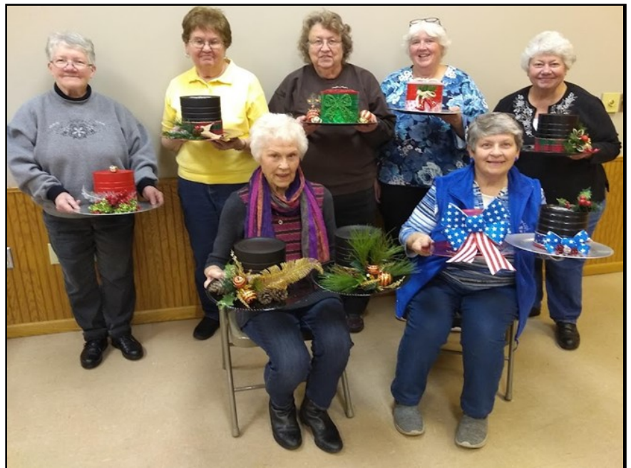
Decorated Coffee Can and Charger Plate made into Top Hats are ready to be filled with cookies, candy or snacks for a family gathering.