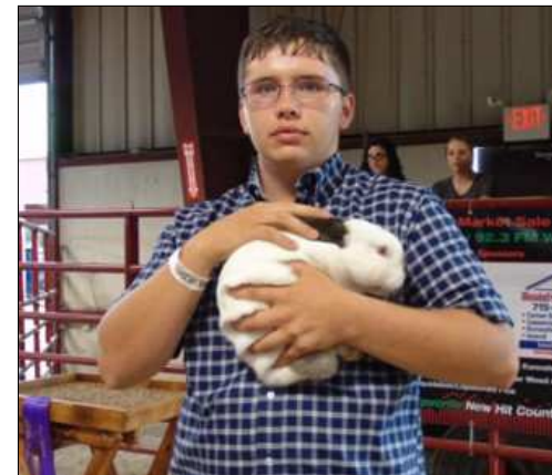
2021 Grand Champion Single Fryer Rabbit