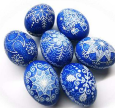
Examples of Ukraine Pysanky