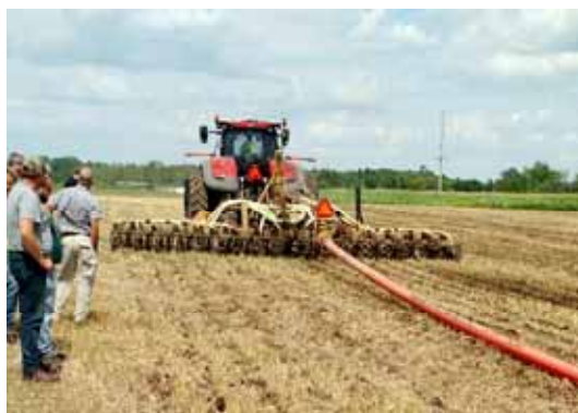
The "Bazooka", a new manure field applicator, is demonstrated during a UW-Extension/Forage Council Field Day. Over 80 people attended the August 9th event near Manawa.